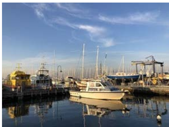
Williamstown Maritime Precinct

https://getinvolved.transport.vic.gov.au/williamstown-maritime-precinct