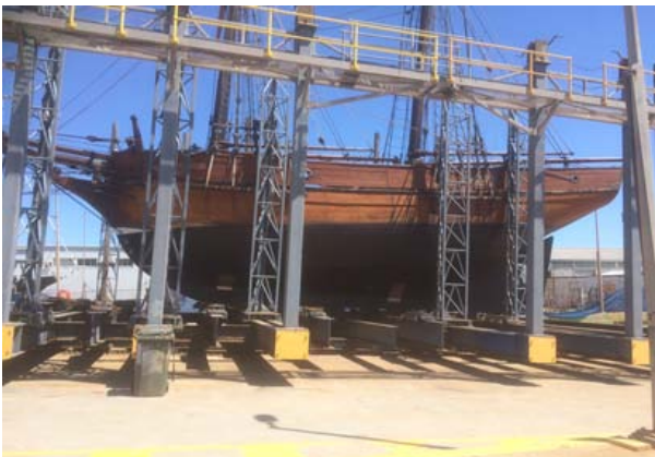
The Enterprise on the slipway 2001