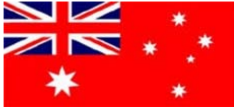
RED ENSIGN 1908