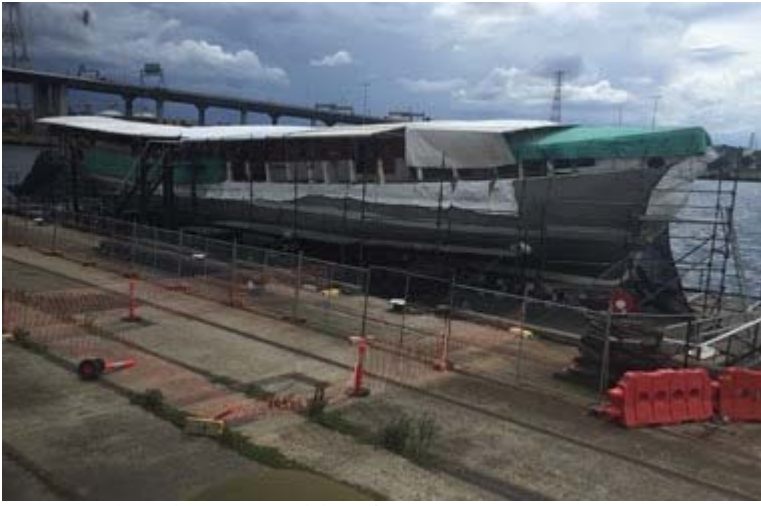
On North Wharf, Docklands