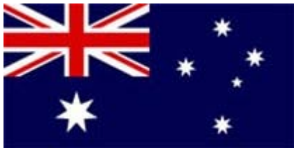
BLUE ENSIGN 1903

Flags as the means of information exchange (i.e. signaling) between ships and the shore obviously pre-dates modern technologies, yet flags retain considerable fascination among maritime heritage enthusiasts. Quoting ANFA: in the first half of the 20th century, the Red Ensign had widespread use in Australia. The Red Ensign is the same as the Australian National Flag (the Blue Ensign). On 3 September 1901, following Federation, the Australian National Flag (Blue Ensign) became the official national flag of Australia, and has remained so ever since. At the same time, the Red Ensign became the flag of Merchant Naval Shipping, and has remained so ever since. See https://www.anfa-national.org.au/history-of-our-flag/anf-detailed-history/blue-and-red-ensigns/