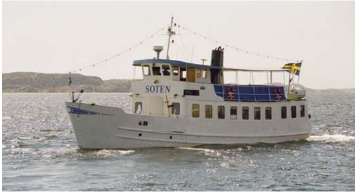
A Swedish 'K' Ship

jeopardized and the report shows that we have reason to be worried about the future.