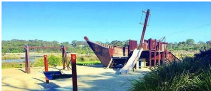
The playground at Inverloch Park, Anglesea

Inspired by those working on the Amazon Wreck project at Inverloch, MMHN made a submission to Surf Coast Shire about a planned up-grade of an immensely popular playground at Anglesea known as both Coogoorah Park and Inverloch Park. A key but aging attraction in the park is a climbing construction which 'loosely' references the barque Inverloch wrecked on Ingoldesby Reef off the beach at Anglesea in 1902. MMHN took the view that it was important to continue to capture the imagination of the next generation of maritime heritage enthusiasts. Clambering around on the 'ship', children (and their parents) learn about the realities of the shipwreck coast. Council has a responsibility to acknowledge and optimize the value of maritime heritage by retaining the maritime theme of the park. Happily, the Surf Coast Shire appears to agree, acknowledging value in retaining a nautical theme, educational interpretative signage about the Aboriginal history of the location and the history of the Inverloch wreck . MMHN commends the Surf Coast Shire for its recognition that maritime heritage is important. For a thrilling contemporary newspaper account of the wreck of the Inverloch , which involved the tug Albatross , see https://trove.nla.gov.au/newspaper/article/89512247/9168351