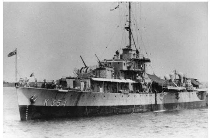
HMAS Gascoyne was one of numerous RAN ships to fight in the Pacific theatre

July 1945 also saw the River class frigate Gascoyne (I) carry out the last naval bombardments in the Balikpapan area. On 26 July, in support of a military force designated BUCKFORCE, Gascoyne proceeded up the Balikpapan River, engaging three separate Japanese held targets as well as landing a military patrol to inspect the village of Mentawir. This action proved to be Gascoyne's last in the war against Japan.