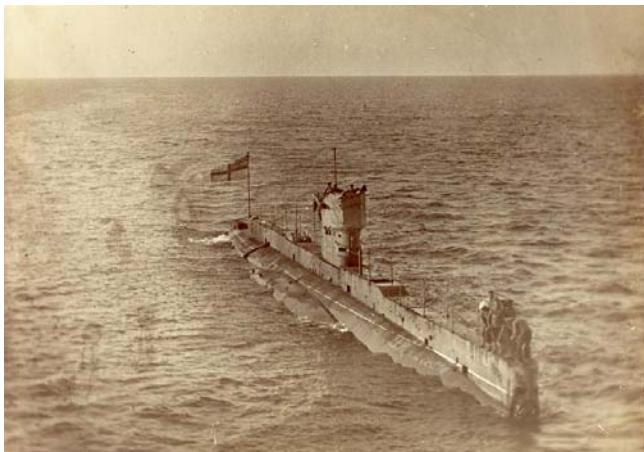
The Australian submarine AE2