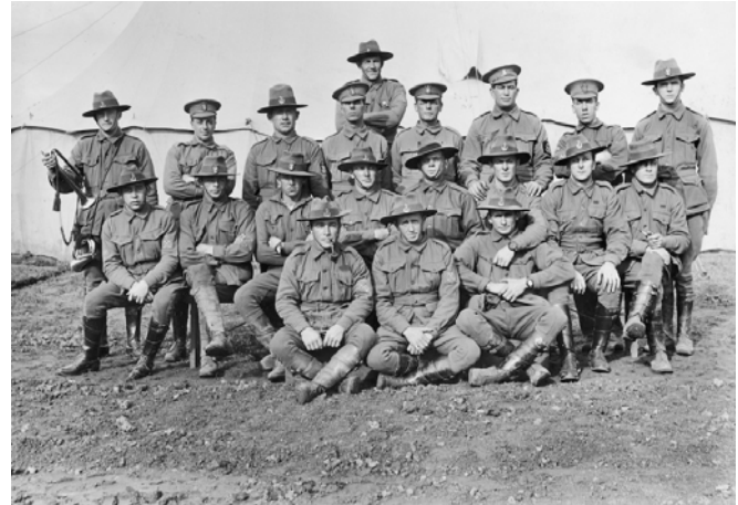
Ratings of the 1 st RANBT at Domain Camp, Melbourne, 1915, prior to embarking for overseas service

Also at Gallipoli was the 1 st Royal Australian Naval Bridging Train (1 st RANBT), formed under the command of Lieutenant Commander LS Bracegirdle, RN, as a mobile naval engineering unit equipped to build pontoons and bridges in support of the military. The initial concept was that it would serve on the battlefields of the Western Front in much the same manner as the engineering elements of the Royal Navy Division. The term 'train', was a direct reference to the horse-drawn wagons that would, in theory, form and move 'in train' to carry the unit's heavy lumber, building supplies and equipment. Many of the ratings serving in the 1 st RANBT were designated 'drivers' and again this refers to wagon drivers.