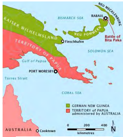
Location of Bitia Paka 1914.

Submarines AE1 and AE2 joined the convoy on the way to Port Moresby, where it was met by HMAS Warrego and Yarra and the requisitioned liner Kanowna (which was sent home shortly afterward following an on-board mutiny by the ship's stokers and did not take part in any action). The convoy rendezvoused with HMAS Australia at Rossel Island before continuing on to Rabaul.