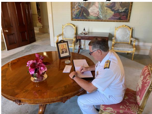
SNOVIC signing HRH Prince Philip, the Duke of Edinburgh, Condolence book at Government House, Victoria, on behalf of Navy members in Victoria.

From the first response with aircraft flying from HMAS Albatross to personnel on the ground in the NSW mid-north coast, Navy has been involved in rescue, recovery and clean up efforts during Operation NSW Flood Assist.