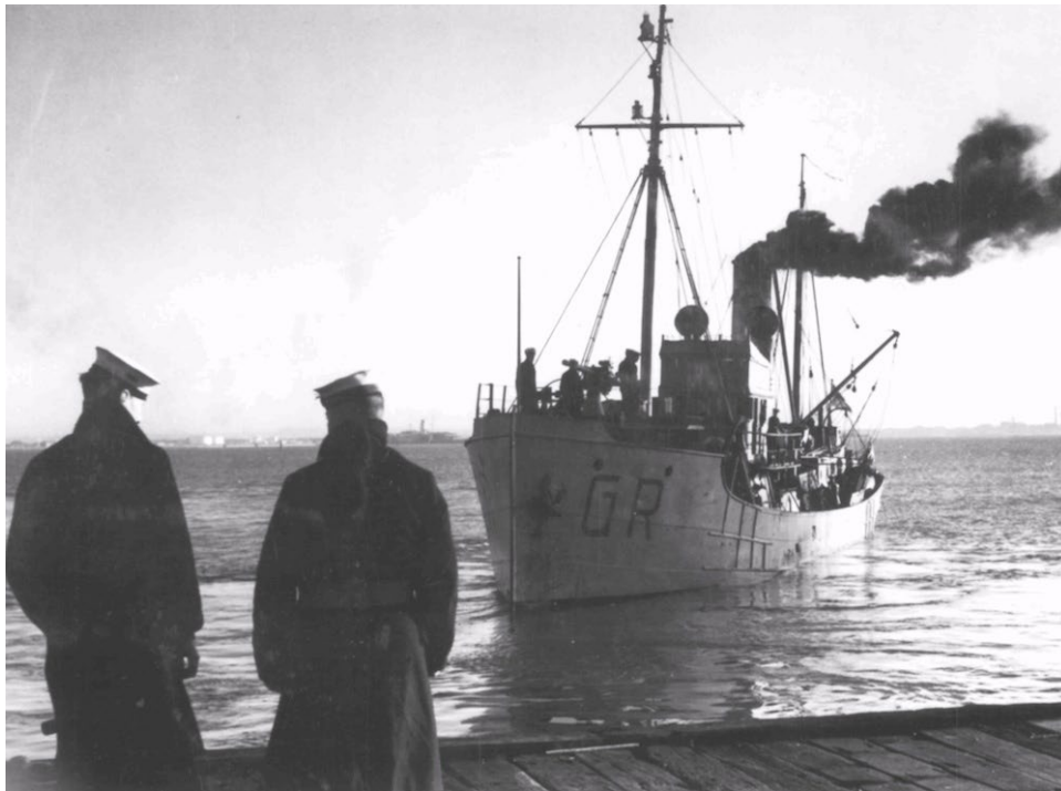
HMAS Goorangai in Port Phillip Bay. Her wartime designation is prominently displayed on her hull.

the 8 th of September 1939, one of eight vessels requisitioned from Cam & Sons, and commissioned as HMAS Goorangai at Melbourne on the 9 th of October 1939 for service as an auxiliary minesweeper. She joined Minesweeping Group 54 in Melbourne and operated primarily in Bass Strait.