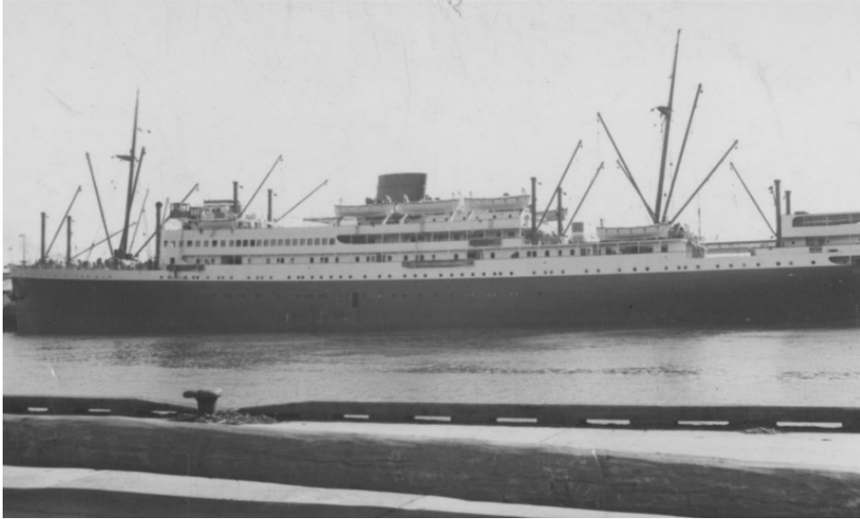
The 10,364 ton MV Duntroon, which collided with the 223 ton HMAS Goorangai on 20 November 1940.

avail with only minor flotsam recovered from the water. Just six bodies were recovered in subsequent salvage operations.