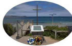
HMAS Goorangai Memorial, Queenscliff

The Navy Victoria Network proudly supports five 'Flagship' events during the year, namely the Creswell Oration held in March; the Battle of the Coral Sea commemorative service at the Shrine of Remembrance in May; the Battle of Bita Paka wreath laying also at the Shrine in September; the Seafarers Memorial Service at St Paul's Cathedral on 22nd October this year, and the HMAS Goorangai Service held in Queenscliff in November. The last of these key annual events is almost certainly the least well known of the five, so as we approach this year's service, it is appropriate to give some background to the tragedy and to encourage your attendance.