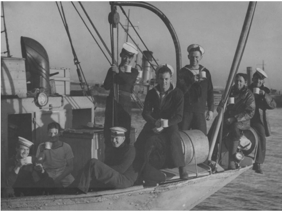
Members of Goorangai's crew photographed on the morning of her collision with MV Duntroon

The men who lost their lives in HMAS Goorangai on the 20 th of November 1940 were: