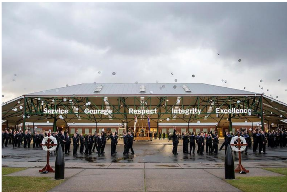
Graduating members of General Entry 389 Shippl Division throw their hats in the air at the end of their graduation parade at the Navy Recruit School at HMAS Cerberus, Victoria.

Recruits for the Royal Australian Navy were trained exclusively on board Tingira until 1925, when the Recruit School was established at HMAS Cerberus .