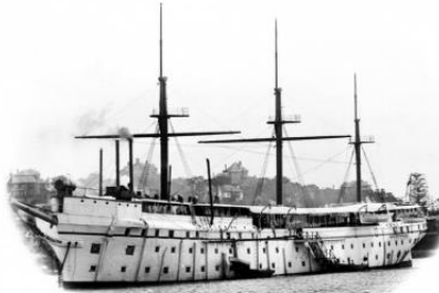
HMAS Tingira, her topmasts gone and in her new white livery as a training ship.

Recruits for the Royal Australian Navy were trained exclusively on board Tingira until 1925, when the Recruit School was established at HMAS Cerberus .