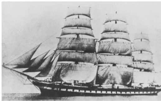
The clipper ship Sobraon under full sail in her heyday.

The Royal Australian Navy Recruit School had its beginnings in 1912 when the Clipper Ship Sobraon was Commissioned in Sydney as the 'Boy's Training Ship' HMAS Tingira .