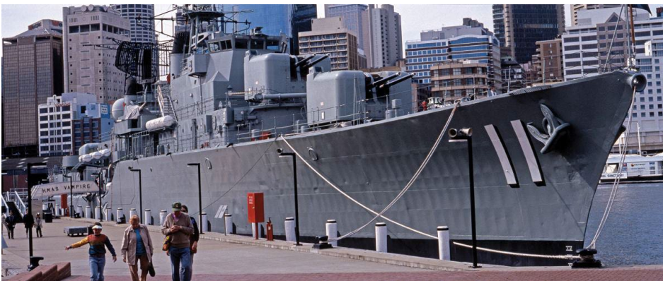
HMAS Vampire at the Australian National Maritime Museum

Happily, the loss of Vampire (I), was not the end of that ship's name in the RAN. In June 1959 a second HMAS Vampire , a Daring Class destroyer, entered service with the Navy. This HMAS Vampire added the Malaysia 1964-66 Battle Honours to those of its namesake. Among its many tasking throughout its 27 years of service, were escort duties during the Vietnam War. HMAS Vampire II was decommissioned on the 13th August 1986 and is today preserved as a museum ship at the Australian National Maritime Museum in Sydney.