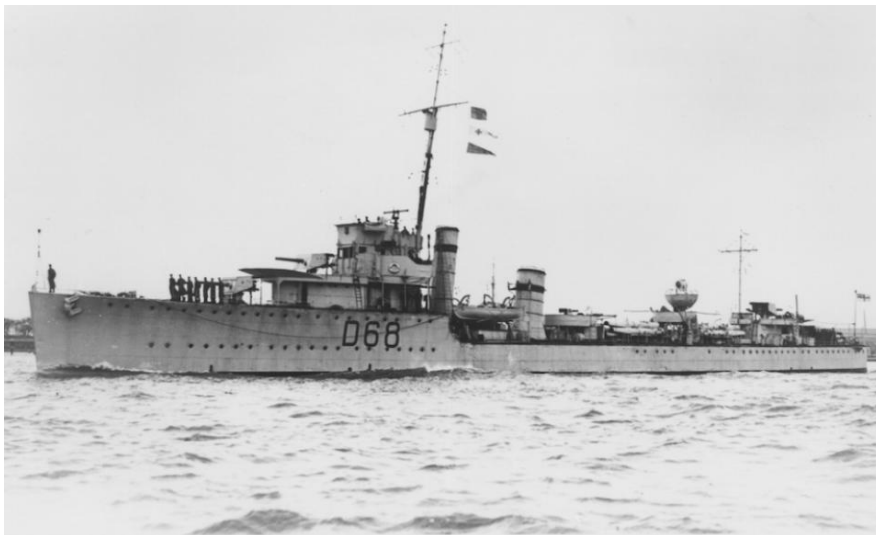
HMAS Vampire in the Mediterranean

Launched as HMS Vampire in 1917, she served in the Royal Navy during the First World War. The vessel was loaned to the Royal Australian Navy (RAN) and commissioned at Portsmouth on 11 October 1933. During the 1930s, Vampire operated as a naval reserve vessel, based at HMAS Cerberus (Flinders Naval Depot).