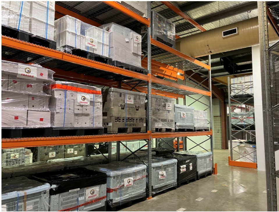
The first group of palletised artefacts at Banksmeadow awaiting unpacking and transfer to separate smaller storage areas for uniforms, paper products, metal, plastic and timber objects, art works and ships bells.