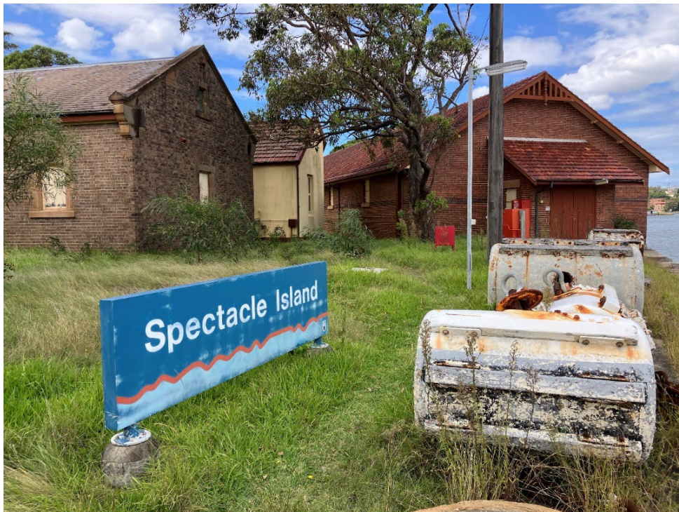
The NHC has been located on Spectacle Island for the past 50 years. By the end of the year the aim is to have the entire collection re-located to Banksmeadow, adjacent to the Sydney Airport.

The last 15 months have been an exciting time as funding has now been provided by Navy Headquarters to relocate the NHC from the former RAN Armament Depot Buildings on Spectacle Island (SI) to the Multi-User Depot at Banksmeadow, NSW.