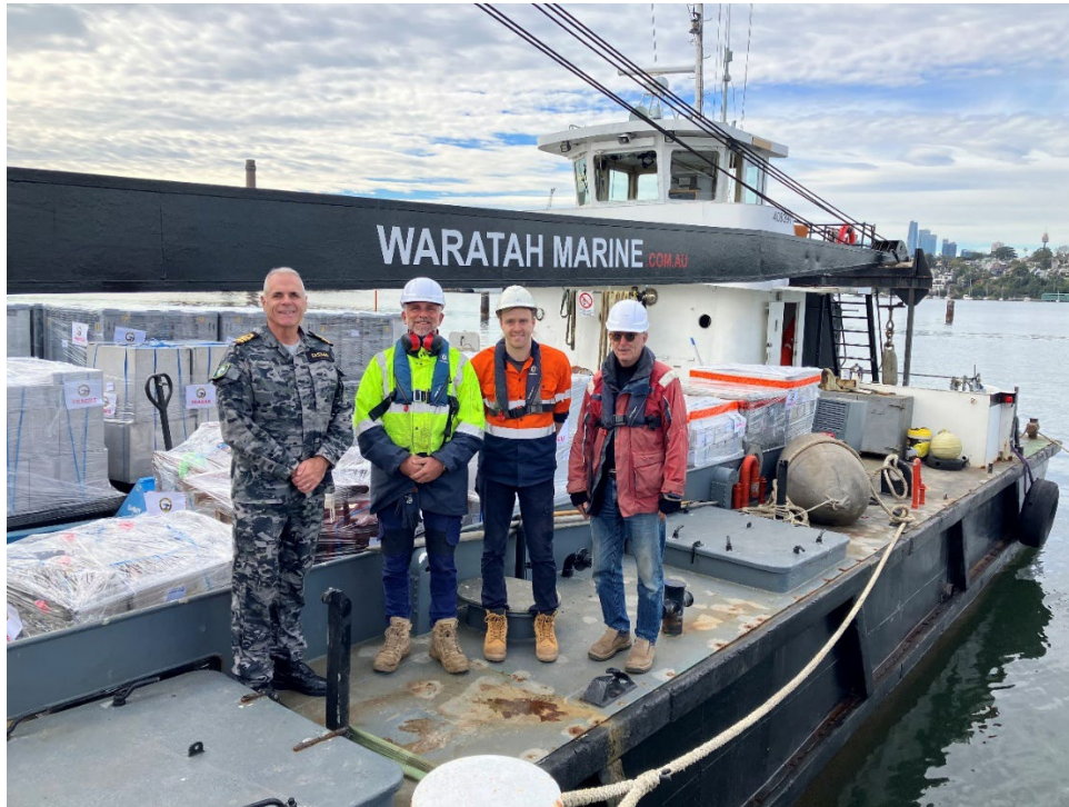
Relocating the collection one barge trip at a time, with thanks from the team at Waratah Marine.

Garden Island. Joint Logistic Unit-East have provided the trucks to transport and store the pallets temporarily last year at Moorebank before the Banksmeadow site was ready to receive the pallets in two small warehouses in December last year.