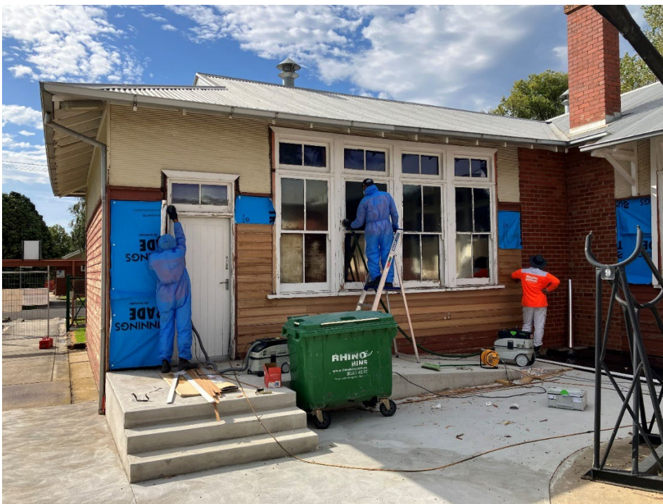
Above and Below – Refurbishment of the external surface of the HLC is also occurring and will be completed by Open Day. Thanks to our former and current HLC Managers for initiating this project and seeing it come to fruition!

Nova Systems said it has developed cutting-edge AI technology to process sonar imagery from autonomous underwater vehicles (AUVs) and detect unseen threats. The AI tool processes and examines sonar imagery collected from autonomous underwater vehicles (AUVs) and notifies the operator if an unknown object or threat is detected.