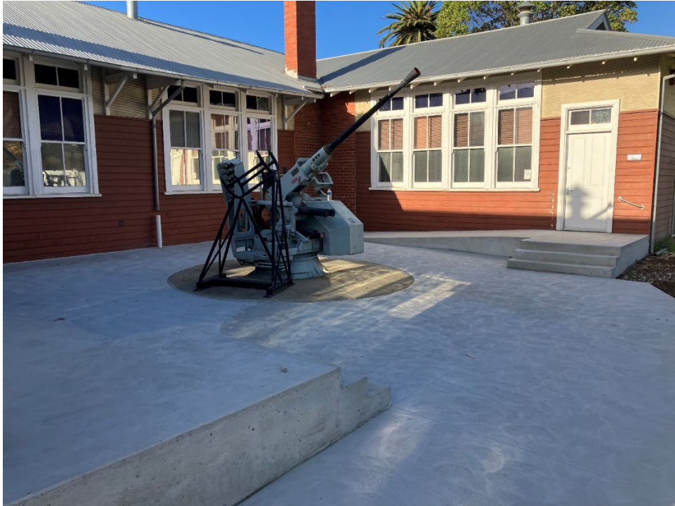
Work is also underway to enhance the Cerberus Heritage and Learning Centre, with a new disable ramp entry soon to be completed.

would form part of the works to be delivered in the next Cerberus Redevelopment.