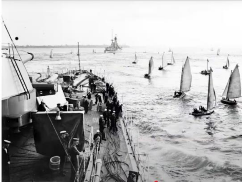
British Fleet met by Couta boats from the Quenscliff Fishing Fleet as it enters Port Phillip Heads at dawn during the visit to Australia.

In March 1924 a fleet of Royal Navy ships visited Australia as part of a world-wide goodwill cruise. The largest battleship in the world (HMS Hood) was accompanied by HMS Repulse and four light cruisers. Melbourne, then the nation's capital, hosted the fleet from 17 th - 24 th March. The visit was a sensation with over 500,000 visitors to the ships, an RAAF flyover, ceremonial marches, dinners, dances and fireworks.