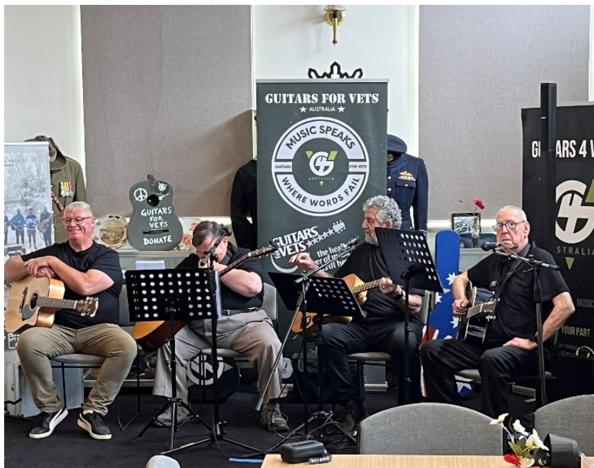
"Where words fail, music speaks."

G4VA is a well-established and powerful music-based initiative that is helping Australian veterans experiencing the challenging effects of PTSD to express themselves and discover new purpose through the healing powers of music.