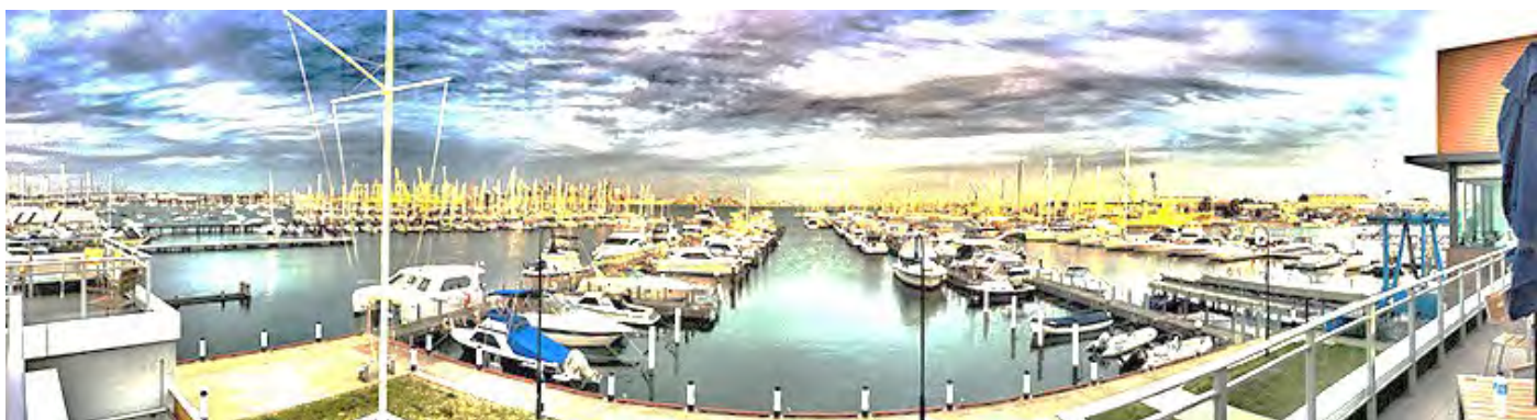
View from the Members Bar

It provides for boating and social interests with particular emphasis on family and community involvement. The Members' bar and dining area on the first floor is open to members and guests. Their function room downstairs caters for up to 300 people. The Club has an extensive program of events throughout the year, including concerts on the lawn, marine education courses, navigation rallies, social cruising and a junior training program. For further information, go to http://www.rvmc.net.au/