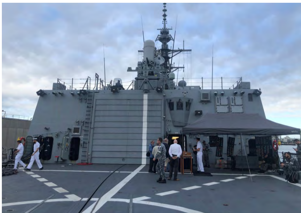
The Flight Deck

Hobart carries a $40 million MH-60R Seahawk helicopter for surveillance and response to support key warfare areas. The surface warfare function will include long range anti-ship missiles and a naval gun capable of firing extended range munitions in support of land forces.