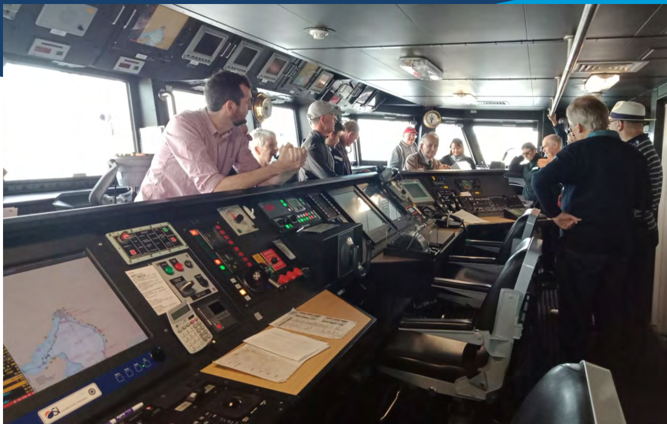
On the Bridge