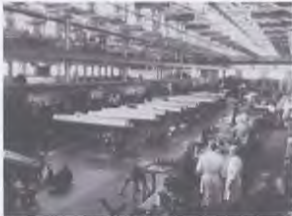
Workers in the Torpedo Factory, Neutral Bay.

The RAN acquired the assistance of Mr Essington Lewis, who directed the Department of Munitions during the Second World War and was a managing director at BHP. It was Lewis' decision to demolish the entire existing infrastructure in Neutral Bay. In keeping with wartime pace, Lewis instigated a meeting at his Melbourne office on Friday and by the evening a contract was signed in which a contractor would begin renovations on the coming Monday. As of February 1943, the RAN Torpedo Factory, in outstandingly short time, had been completed. The factory employed specialist turners and fitters, many from Garden Island who constructed torpedoes with parts acquired from the United States and South Australia.